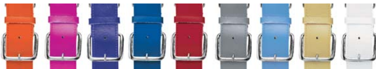
ORANGE 029 POWER PINK 809 PURPLE 050 ROYAL 060 SCARLET 083 SILVER GREY 016 UNIVERSITY BLUE S48 VEGAS GOLD 023 WHITE 005