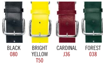
BLACK 080 BRIGHT YELLOW T50 CARDINAL J36 FOREST 038