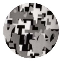
MODERN CAMO PRINT

221317 MSRP: $35.40 LADIES' S-2X CLASSIC FIT 221417 MSRP: $33.30 GIRLS' S-XL CLASSIC FIT