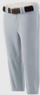
BLUE GREY 053