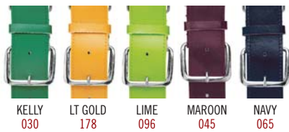
KELLY 030 LT GOLD 178 LIME 096 MAROON 045 NAVY 065