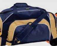
NAVY/VEGAS GOLD/WHITE 312