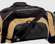
BLACK/VEGAS GOLD/WHITE 612