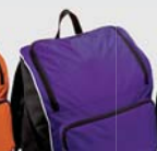
PURPLE/BLACK/ WHITE 497