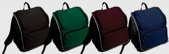
BLACK/BLACK/ WHITE 529