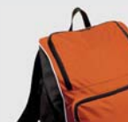
ORANGE/ BLACK/WHITE 322