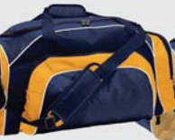
NAVY/LT GOLD/WHITE S30