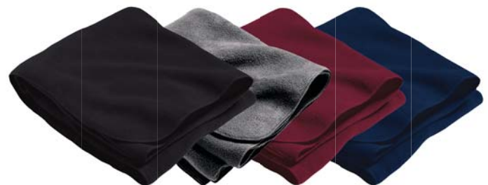
BLACK 080 CHARCOAL HEATHER 017 MAROON 045 NAVY 065

ZIPPERED VINYL BAG, 223051, OR BARREL STRAP, 223052, AVAILABLE AT HOLLOWAYUSA.COM