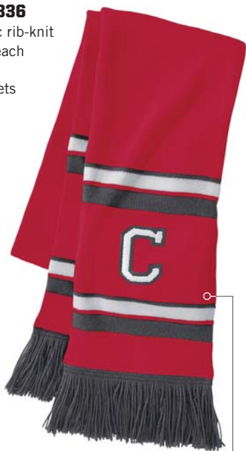
DECORATION ACCESS FOR EASY EMBROIDERY