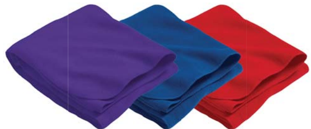
PURPLE 050 ROYAL 060 SCARLET 083