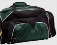
DK GREEN/BLACK/WHITE 520