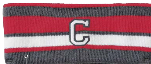
DECORATION ACCESS FOR EASY EMBROIDERY