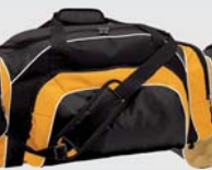
BLACK/LT GOLD/WHITE R21