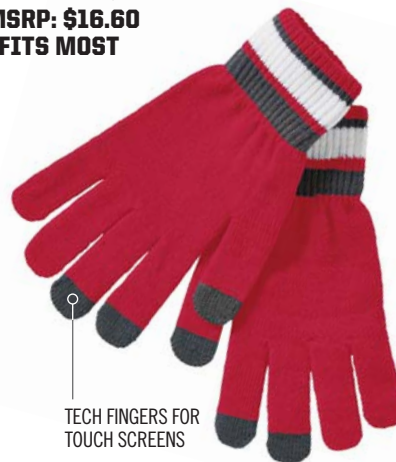
TECH FINGERS FOR TOUCH SCREENS