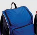
ROYAL/BLACK/ WHITE 526