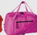
POWER PINK 809